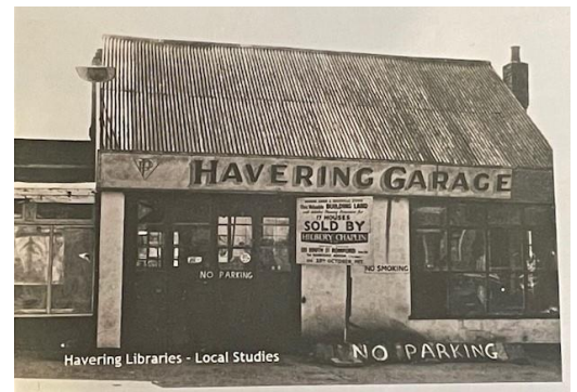
Havering Libraries - Local Studies